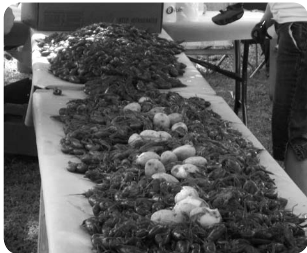
Crawfish boil spread at Bill snipes' family reunion.

If you are a little squeamish on step 3, then it's optional to rip out the "poop chute" (the equivalent of the shrimp vein) before you eat the tail meat, but doing so slows you down. As you might imagine, Mitch was a real pro and at one point was downing 10 crawfish to my sister's one. I was also told that if you aren't up to your elbows in crawfish juice, then you aren't doing it right. I think it helps to have consumed a great deal of alcohol before you begin.